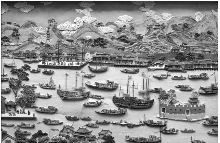
Diorama, View of Canton, circa 1750–1800.

The Americans attempted to eat with chopsticks, with very poor results: "Monkies [sic] with knitting needles would not have looked more ludicrous than some of us did." Finally, their host put an end to their discomfort by ordering western-style plates, knives, forks, and spoons. Then the main portion of the meal began: